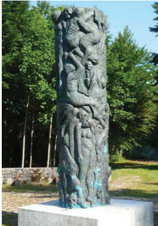
Figure 3. Monument near Šaranova jama in Jadovno, June 2012

The initiative resulted in numerous articles and memoirs of camp survivors in the following years, as well as the partial construction of a monument near one of the karst pits (Šaranova jama) in 1988 (Figure 3).