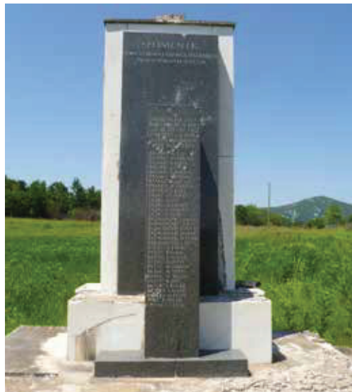
Figure 2. Damaged monument in Barlet, near Gospić

* An example of a typical local monument dedicated to fallen Partisans and civilian victims. The inscriptions read “We must protect the brotherhood and unity for which the fighters from this heroic village gave their lives” and “We must never forget the fallen fighters and what they did for the new socialist Yugoslavia.”